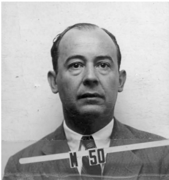
John von Neumann (1903-1957)